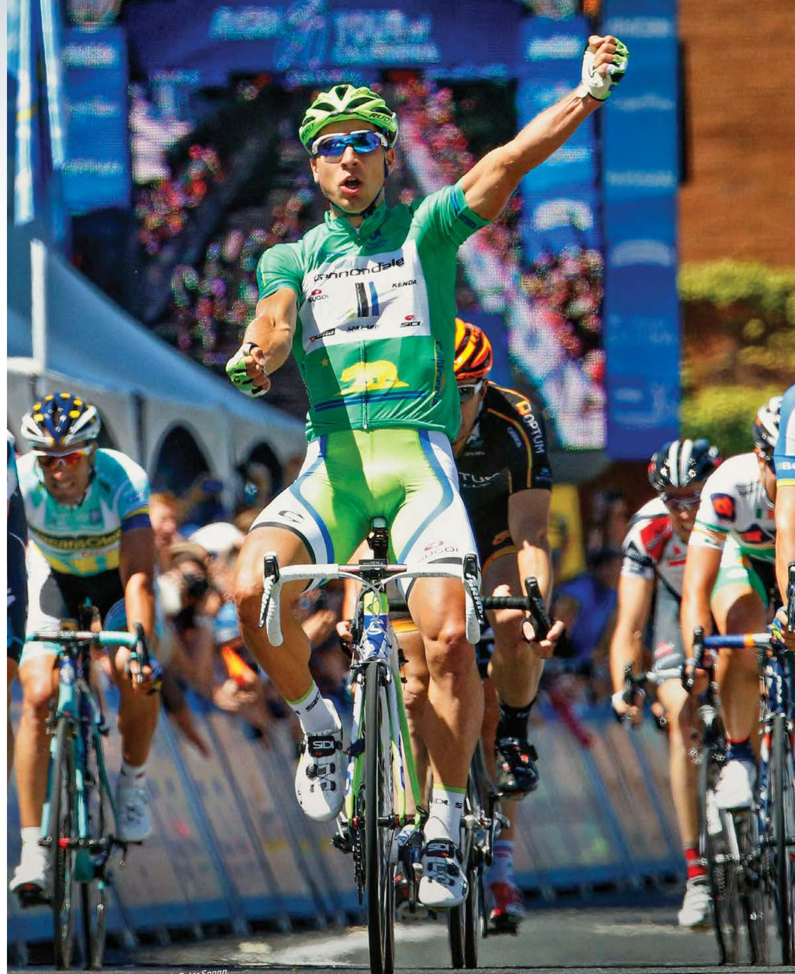
Cannondale Pro Cycling's Peter Sagan, en route to his second consecutive Green Jersey in the Tour of California.

FRAMESET: SuperSix EVO, BallisTec Carbon WHEELSET: Shimano RS01 CRANKSET: FSA Gossamer, BB30, 50/34 COCKPIT: Cannondale C3 GROUP: Shimano 105 / Tiagra COLOR: Charcoal Gray, w/ Black and White - Matte (01)