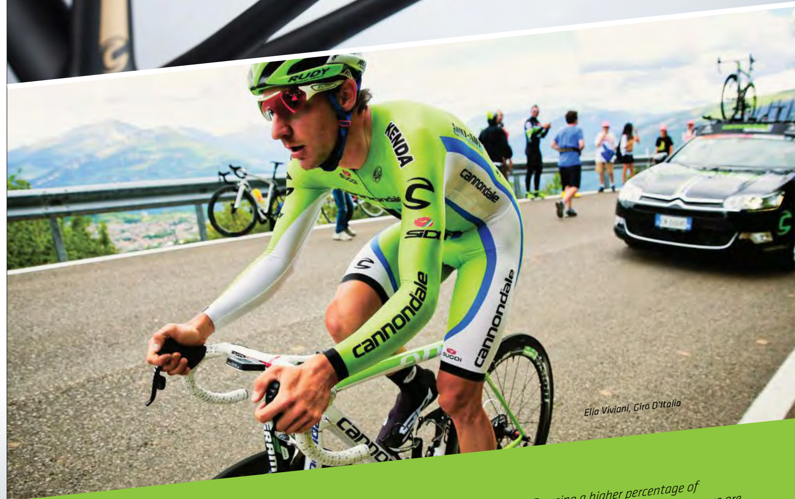
Elia Viviani, Giro D'Italia