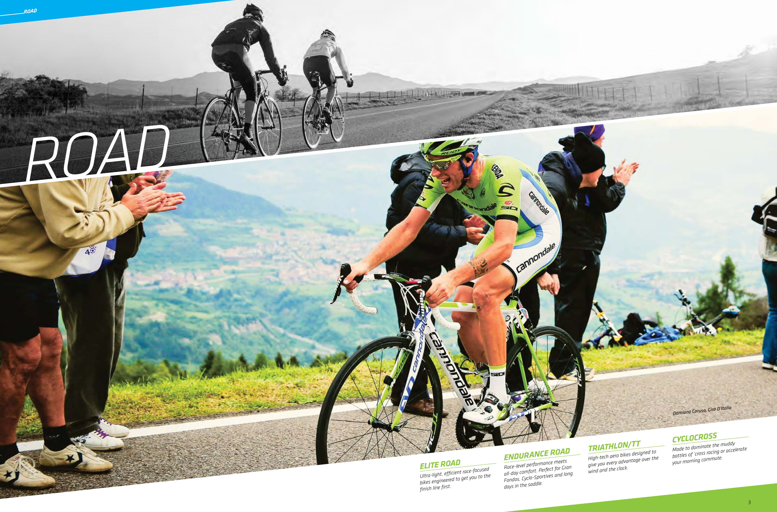
Damiano Caruso, Giro D'Italia