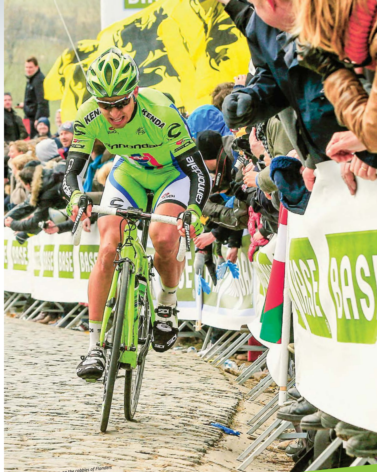
Peter Sagan, on the cobbles of Flanders

FRAMESET: Synapse, BallisTec Hi-MOD Carbon WHEELSET: Mavic Ksyrium Equipe S WTS CRANKSET: HollowGram Si, 50/34 COCKPIT: Cannondale C1 / FSA SL-K GROUP: Shimano Ultegra 6800 COLORS: Carbon, w/ Blue, Gray, White - Gloss (01) // Carbon, w/ White, Black, Gray - Matte (02)